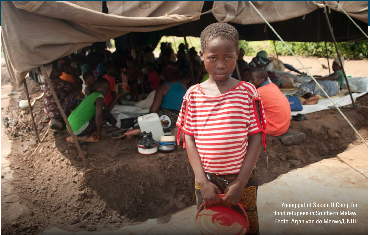
Young girl at Sekeni II Camp for flood refugees in Southern Malawi

Every year, hundreds of millions of dollars are donated in response to disasters and humanitarian crises. Who is giving to disasters? Where do the funds go? For what purposes? And can this data shed light on the most effective use of foundation dollars?