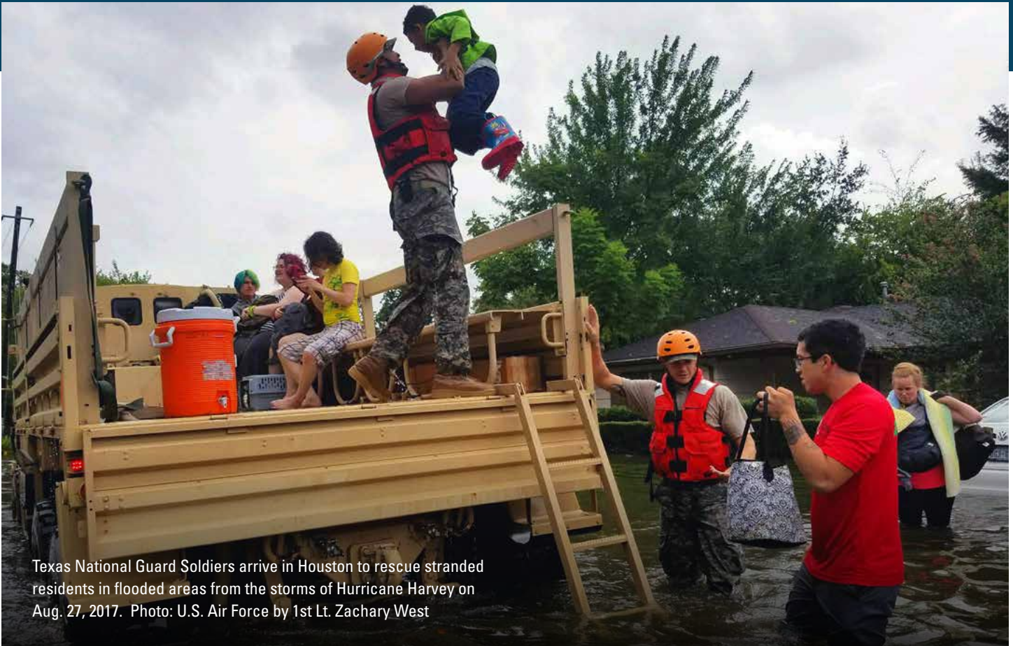
Texas National Guard Soldiers arrive in Houston to rescue stranded residents in flooded areas from the storms of Hurricane Harvey on Aug. 27, 2017.

Every year, hundreds of millions of dollars are donated in response to disasters and humanitarian crises. Who is giving to disasters? Where do the funds go? For what purposes? And can this data shed light on the most effective use of foundation dollars?