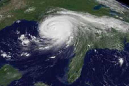
Satellite image of Hurricane Katrina