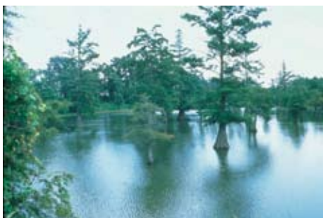
Cypress swamp, Louisiana Bayou.