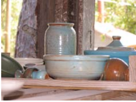
First Shearwater Pottery produced after Hurricane Katrina devastated the Shearwater workshop. Ocean Springs, Mississippi.