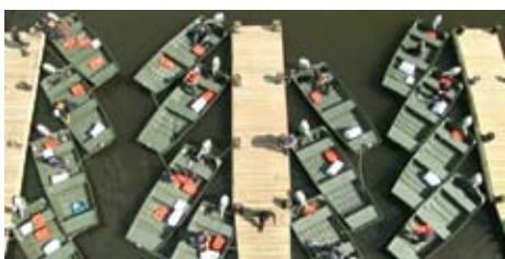
New Orleans Fire Department rescue boats purchased with a grant from The Leary Firefighters Foundation. Lake Pontchartrain, October 2006.