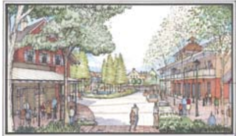
This artist’s rendition of Teche Ridge exhibits the Southern Mutual Help Association’s new paradigm for recovery and strengthening of rural communities. It is a 50-acre housing development on Teche Ridge, Louisiana, an area of New Iberia that has never flooded. This pioneering effort for rural development will feature smart-growth, traditional neighborhood design made for mixed-use and for mixed-income residents. Built with greener and more hazard resistant construction techniques, it will provide 554 housing units, with one-fourth of those units set aside as affordable housing.