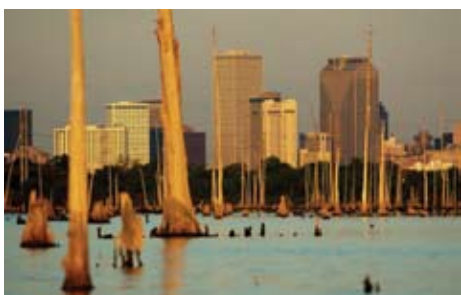
Cypress grove and the New Orleans skyline.