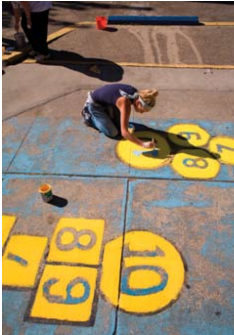
Volunteers brighten a New Orleans playground.