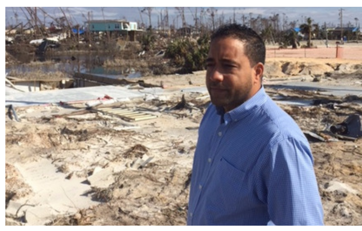
At the Center for Disaster Philanthropy (CDP) , our work takes us on-site to determine needs and how best to respond in support of medium- and long-term recovery.