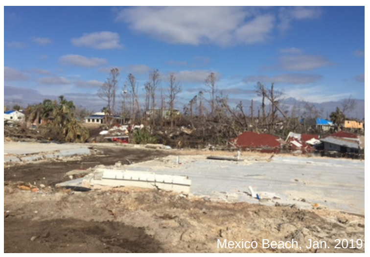
Regional economy has been dealt a major blow – it will take years to recover.

CDP will be investing nearly $1 million in Hurricane Michael recovery efforts in Florida, funding local nonprofits and organizations working directly with the communities they serve.