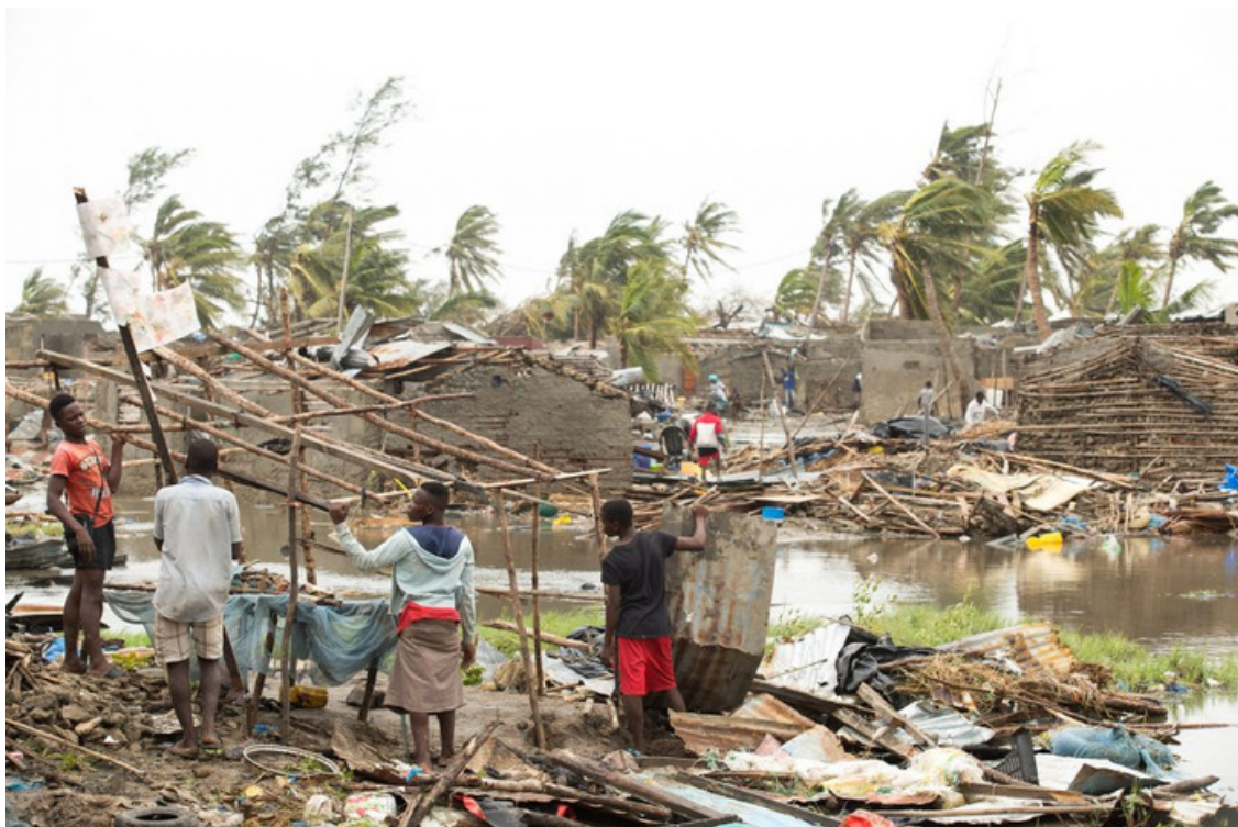
Cyclone Idai aftermath in Mozambique.