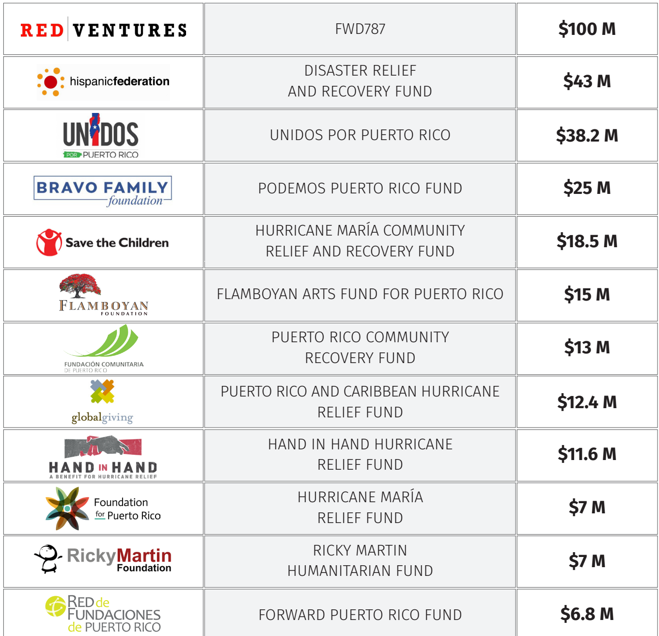
Table 1: FUNDS ESTABLISHED BY STUDY PARTICIPANTS (September 2017 - September 2018)