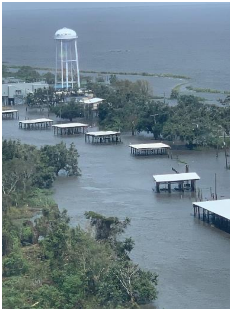
Damage in Louisiana.