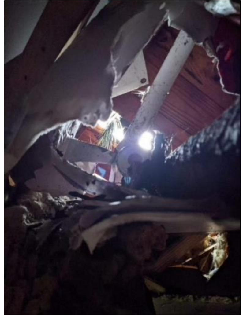
Damage to a home in Louisiana.