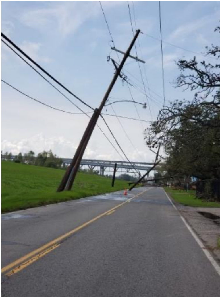
There is extensive damage to power lines throughout the affected area.