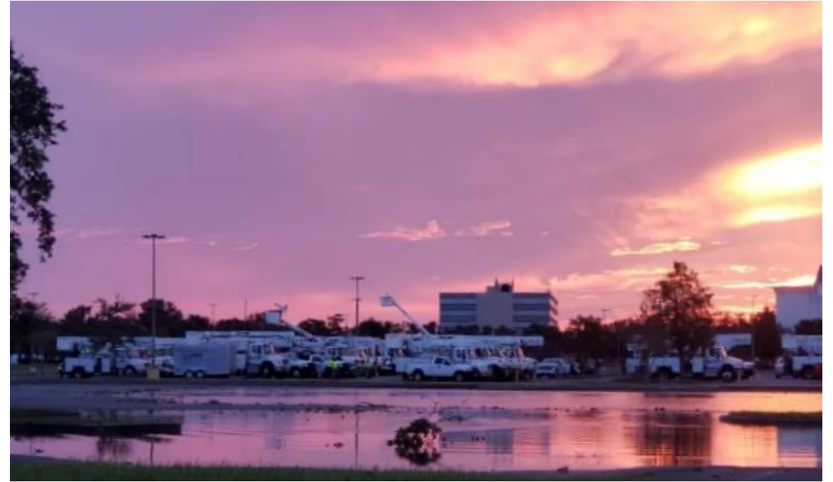
Entergy Corp. bucket trucks staged in Louisiana before Ida.