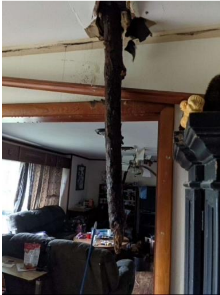
Damage to a home in Louisiana.