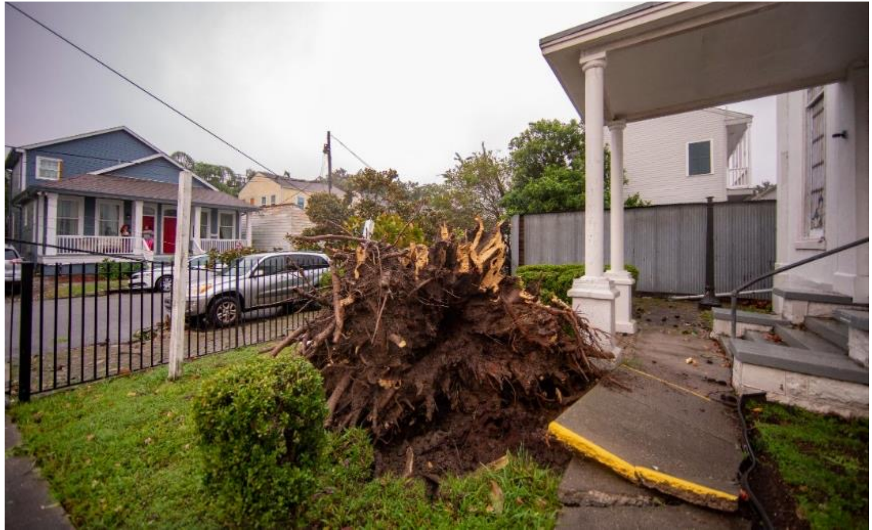
Damage in New Orleans.