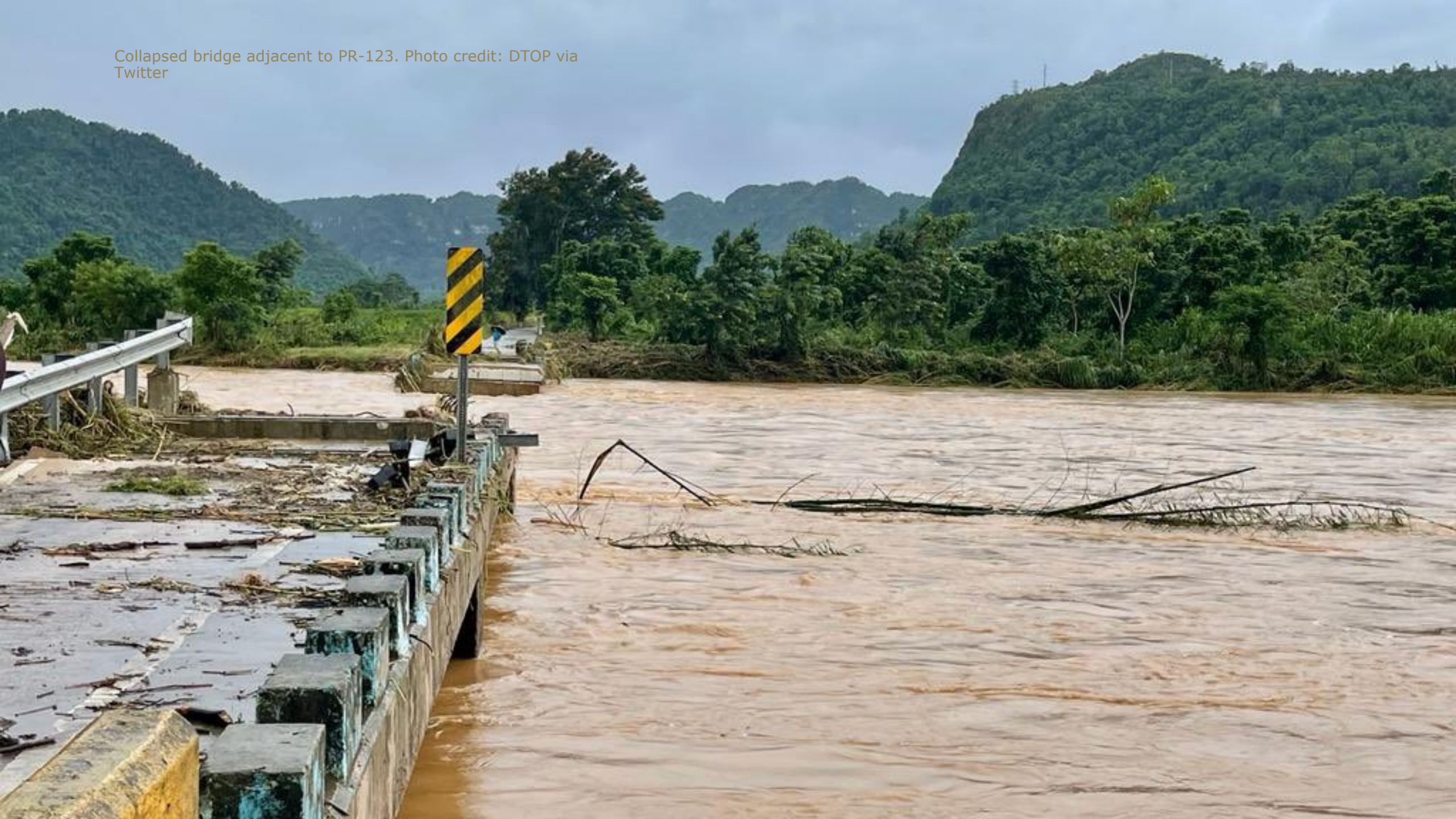
Collapsed bridge adjacent to PR-123.