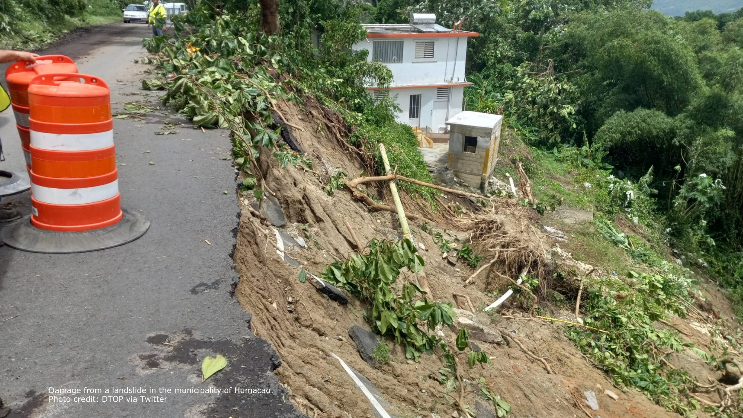
Damage from a landslide in the municipality of Humacao.