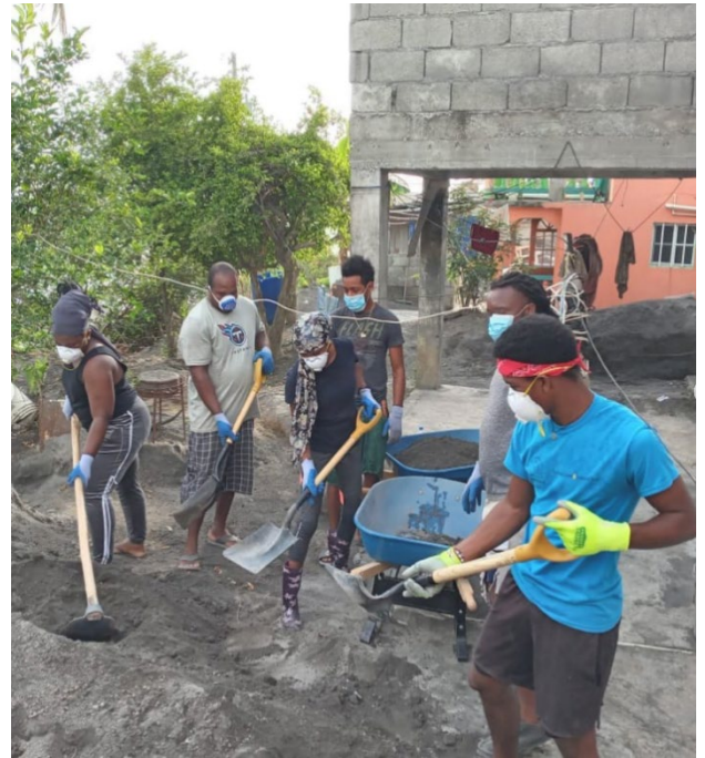
St. Vincent volcano clean up.

Do you need support on disaster trend analysis? Contact us about becoming a back-office client.