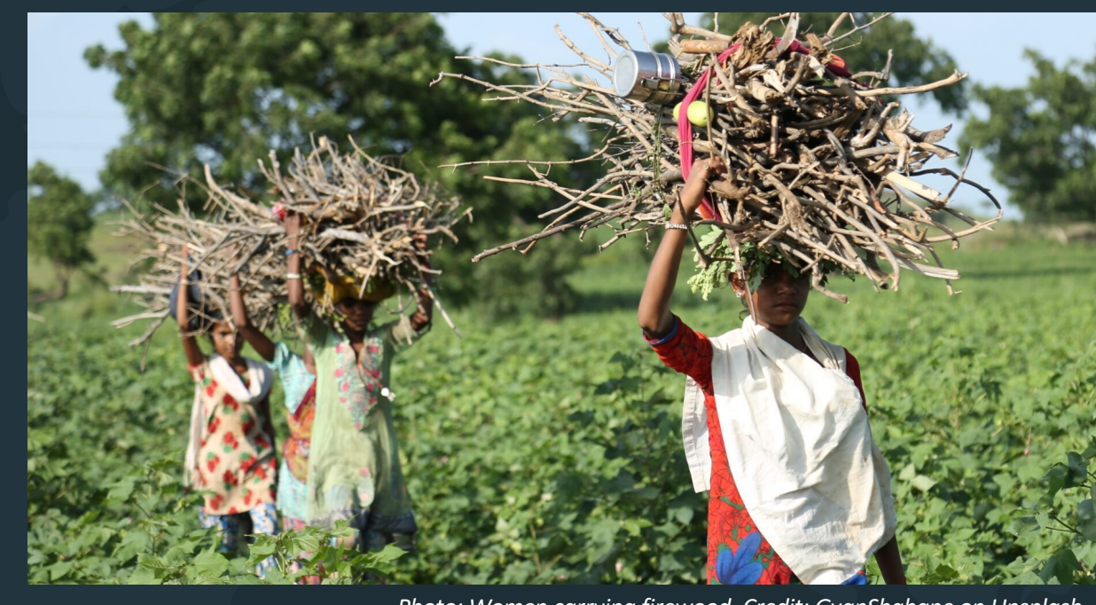
Photo: Women carrying firewood.