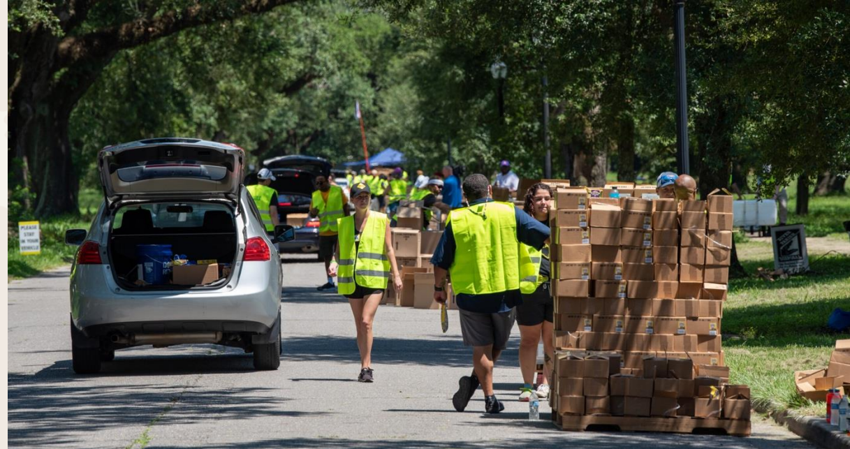
The distribution line at Culture Aid NOLA's July Supply.