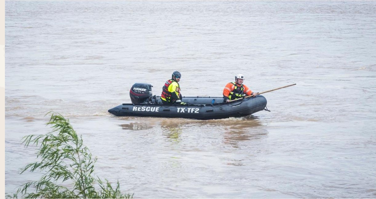
First responders conduct search and rescue efforts in Texas, July 9, 2025.